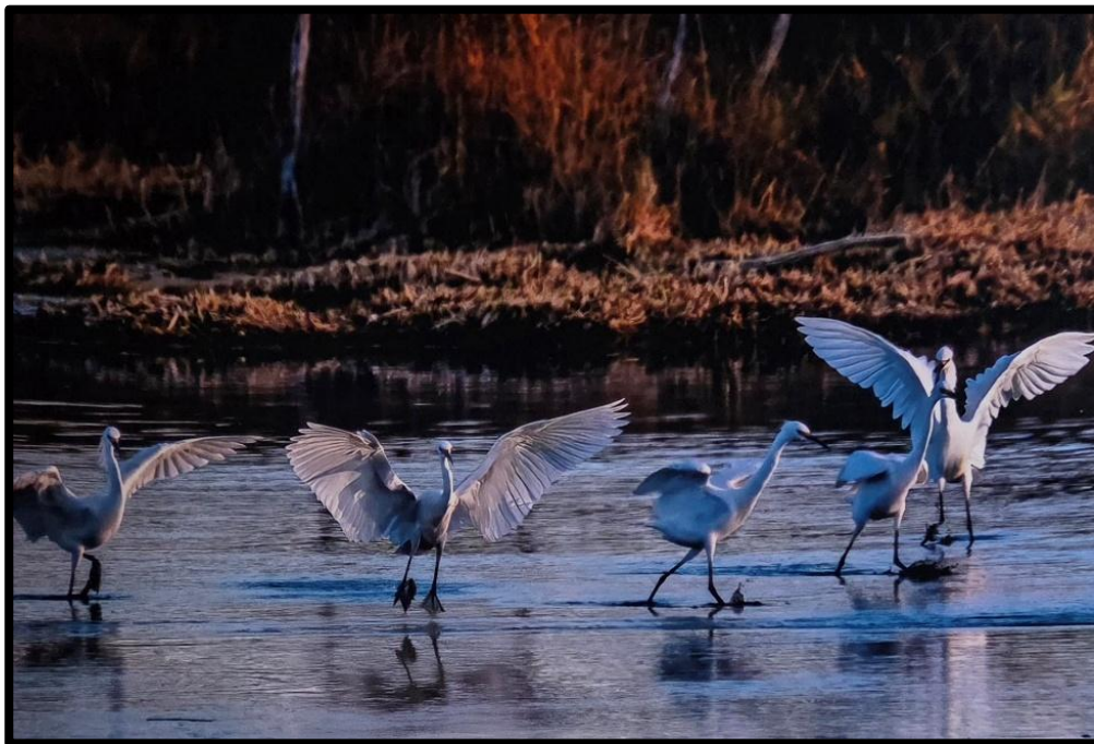
Magical Dance of the White Egret

Dragonfly Festival: Saturday, September 12 --- 9:00 – 3:00 pm. There will also be a program on Friday, September 11. Details will be in the next newsletter